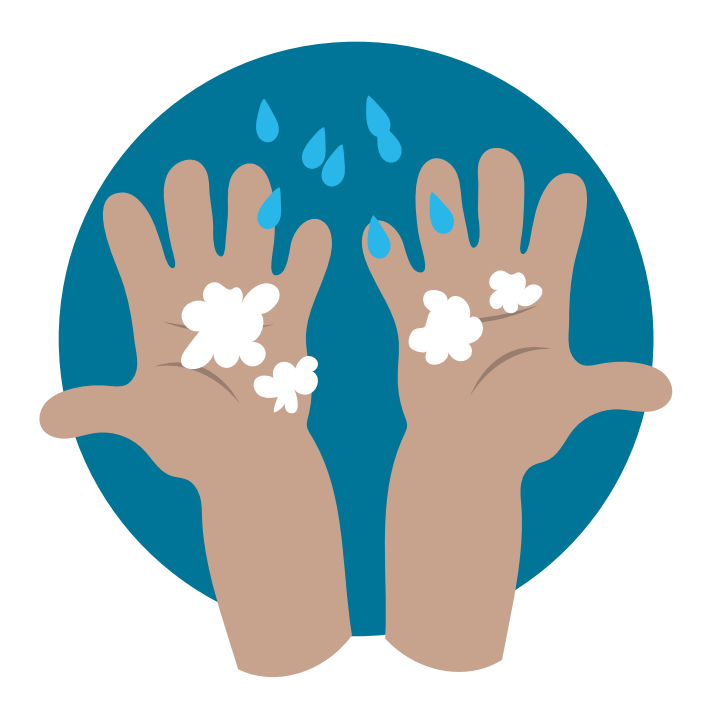
Soap and water